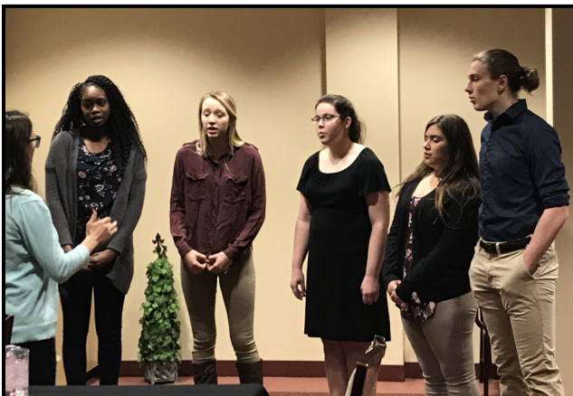
Below: DAK performing at NE Chapter Meeting in Lincoln