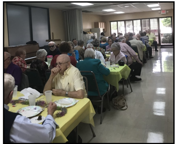
Mesa, AZ group picture