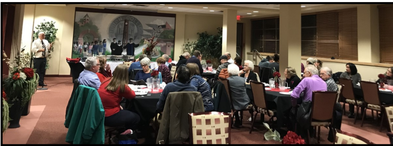
Above: NE Group picture

Thank you for your prayers and your financial support. We appreciate all you do for our students and staff at DAA.