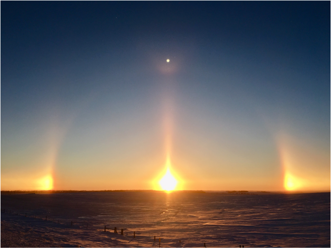
near Summit, SD