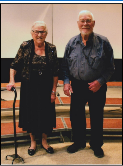
75 Years - Class of 1944