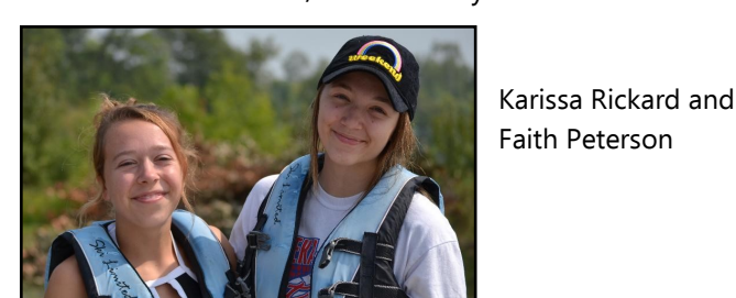
Enjoying games during camp week

Pray for Dakota Adventist Academy, the parents of our students, our staff, and our students as we follow God on the adventure of this 2018/2019 school year.