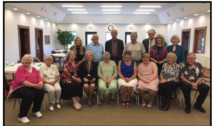
PVA - Spearfish, SD