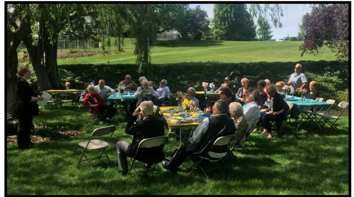
Walla Walla, WA