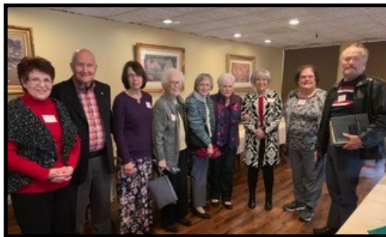
Loma Linda, CA