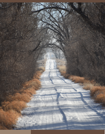
Charles O'Hare Photo