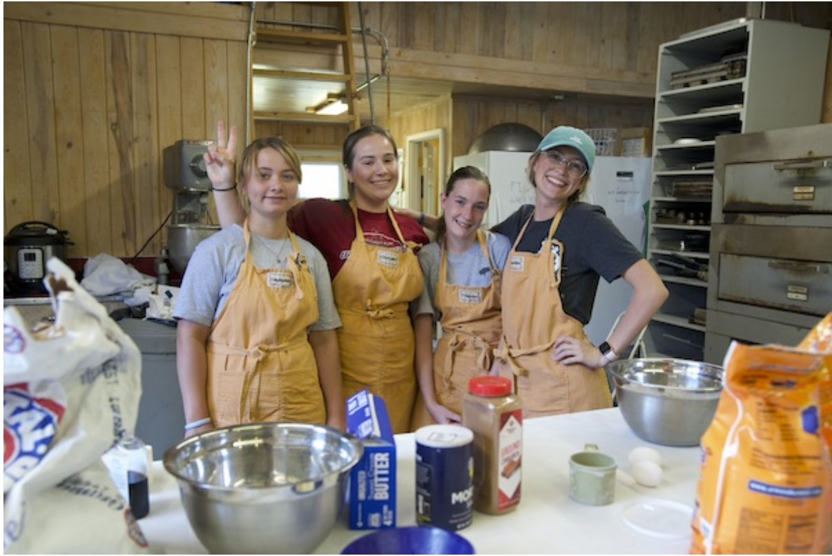
Article by DAA Recruiter Tracy Peterson