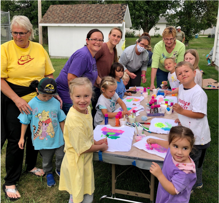
Article and photos from Coreen Schumacher