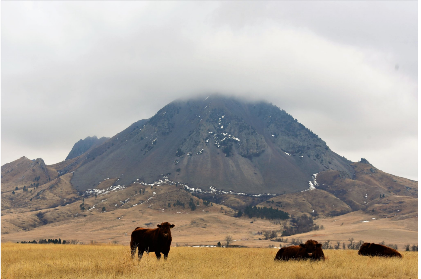
of Bear Butte north of Sturgis, South Dakota.

If anyone has local church news or stories to share, please send event information, news suggestions and/or articles and pictures to: j.dossenko@gmail.com