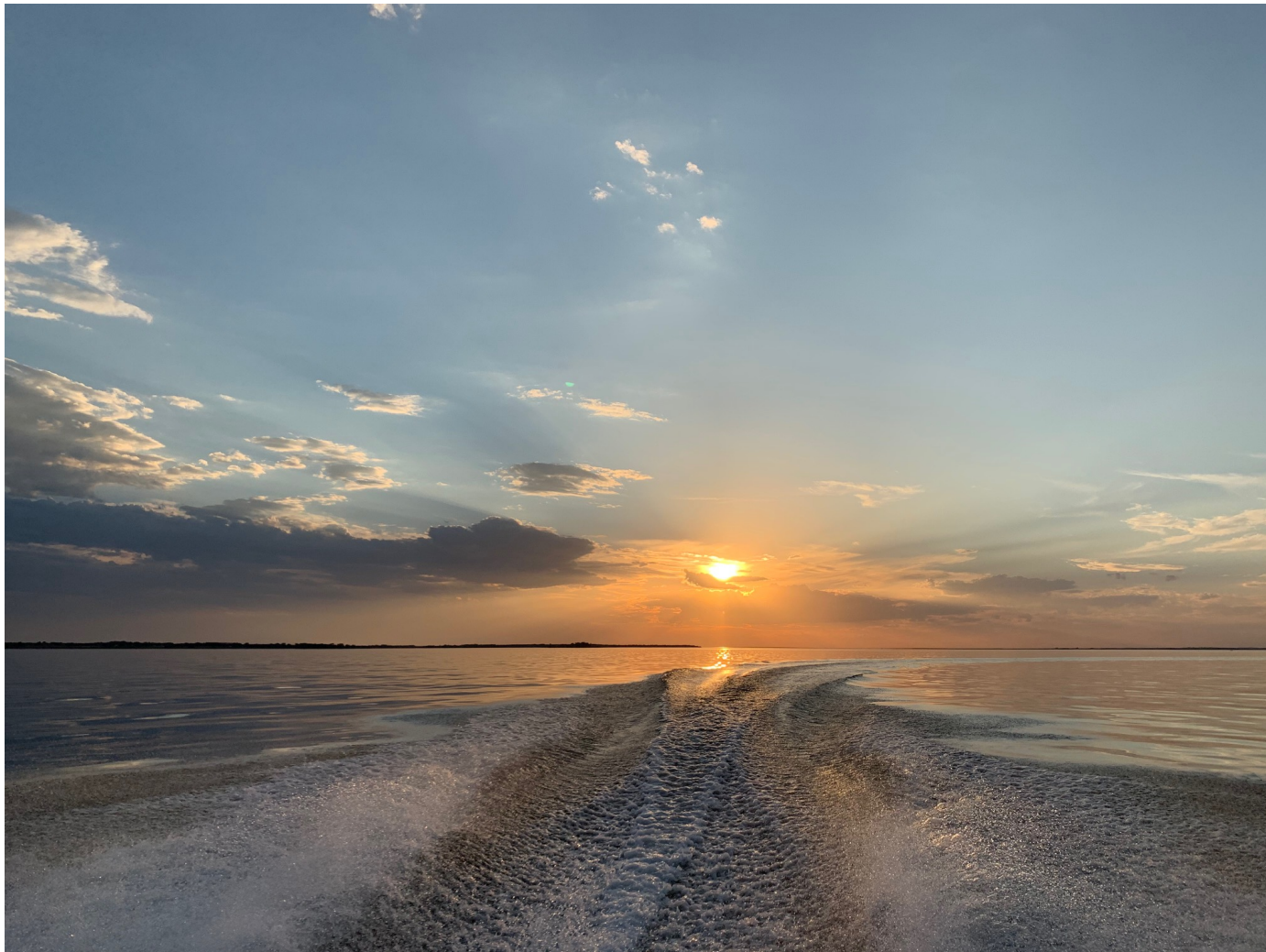
of Lake Sakakawea near Riverdale, North Dakota.