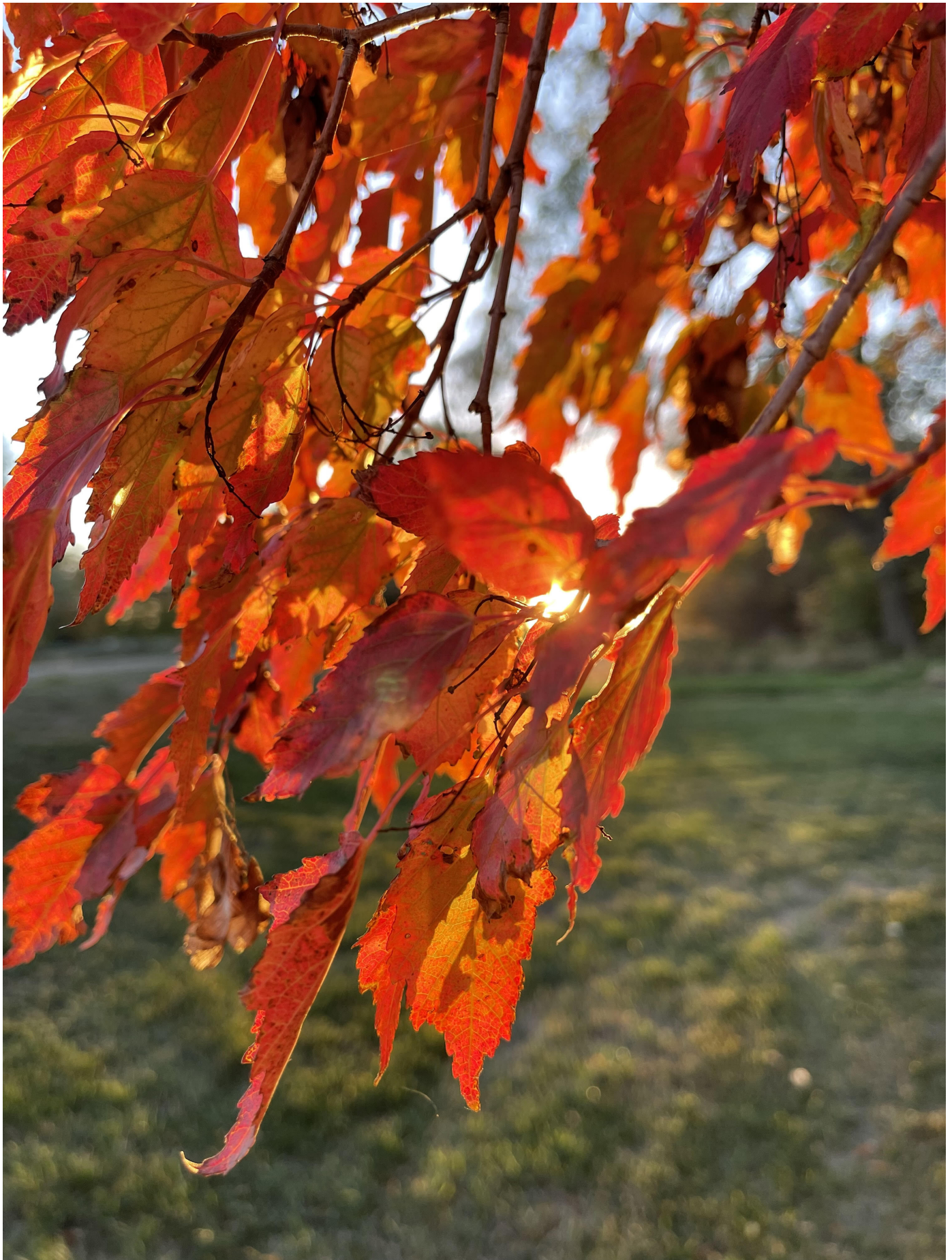
Photo taken by Chrystal Rittenbach in Stutsman County, North Dakota.