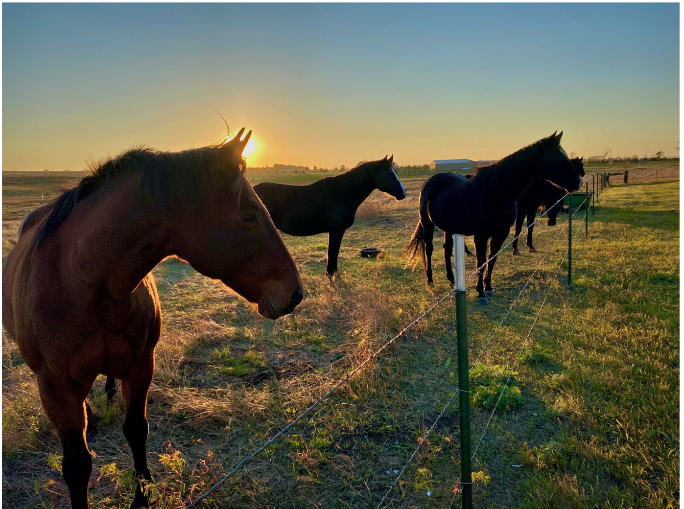
west of Mandan in Morton County, North Dakota.

If anyone has local church news or stories to share, please send event information, news suggestions and/or articles and pictures to: j.dossenko@gmail.com