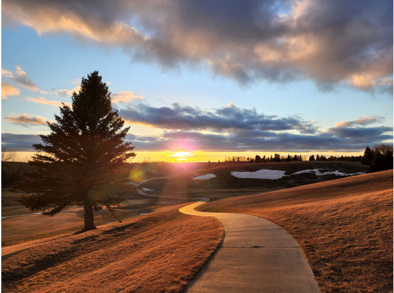
in Stutsman County, North Dakota.

If anyone has local church news or stories to share, please send event information, news suggestions and/or articles and pictures to: j.dossenko@gmail.com