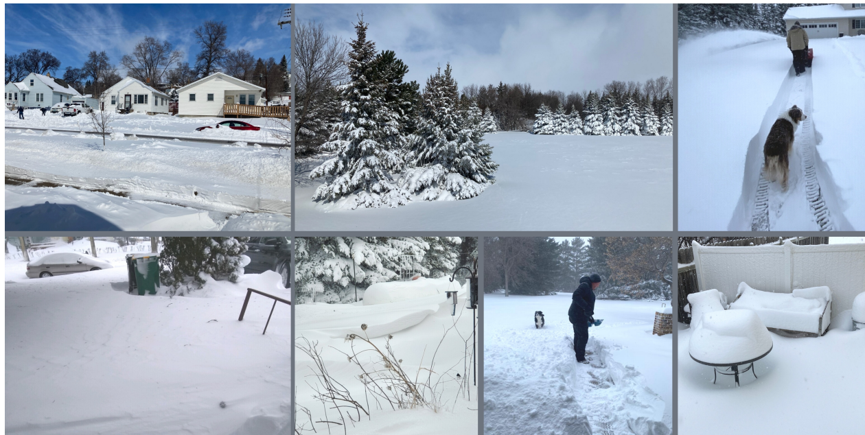
Photos taken by Conference office staff of their yards and streets in Burleigh and Morton counties, North Dakota.

The Dakota Conference office closed the morning of Tuesday, April 12, due to an epic North Dakota blizzard. The Bismarck area has seen a snowfall of over 17 inches with highways and sections of the interstate closed for several days. Blizzard warnings remain in effect through Thursday evening and wind gusts in the region have been recorded as high as 60 mph. Staff have been working from home and look forward to being back at the office to take your calls on Tuesday, April 19, following Easter Weekend.