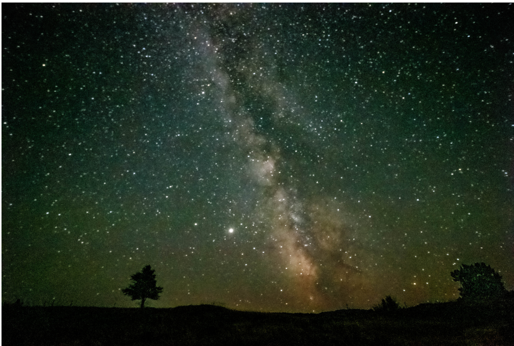
of The Milky Way. Taken in Huff, North Dakota.

If you have local church news or stories to share, please send event information, news suggestions and/or articles, and pictures to: j.dossenکو@gmail.com