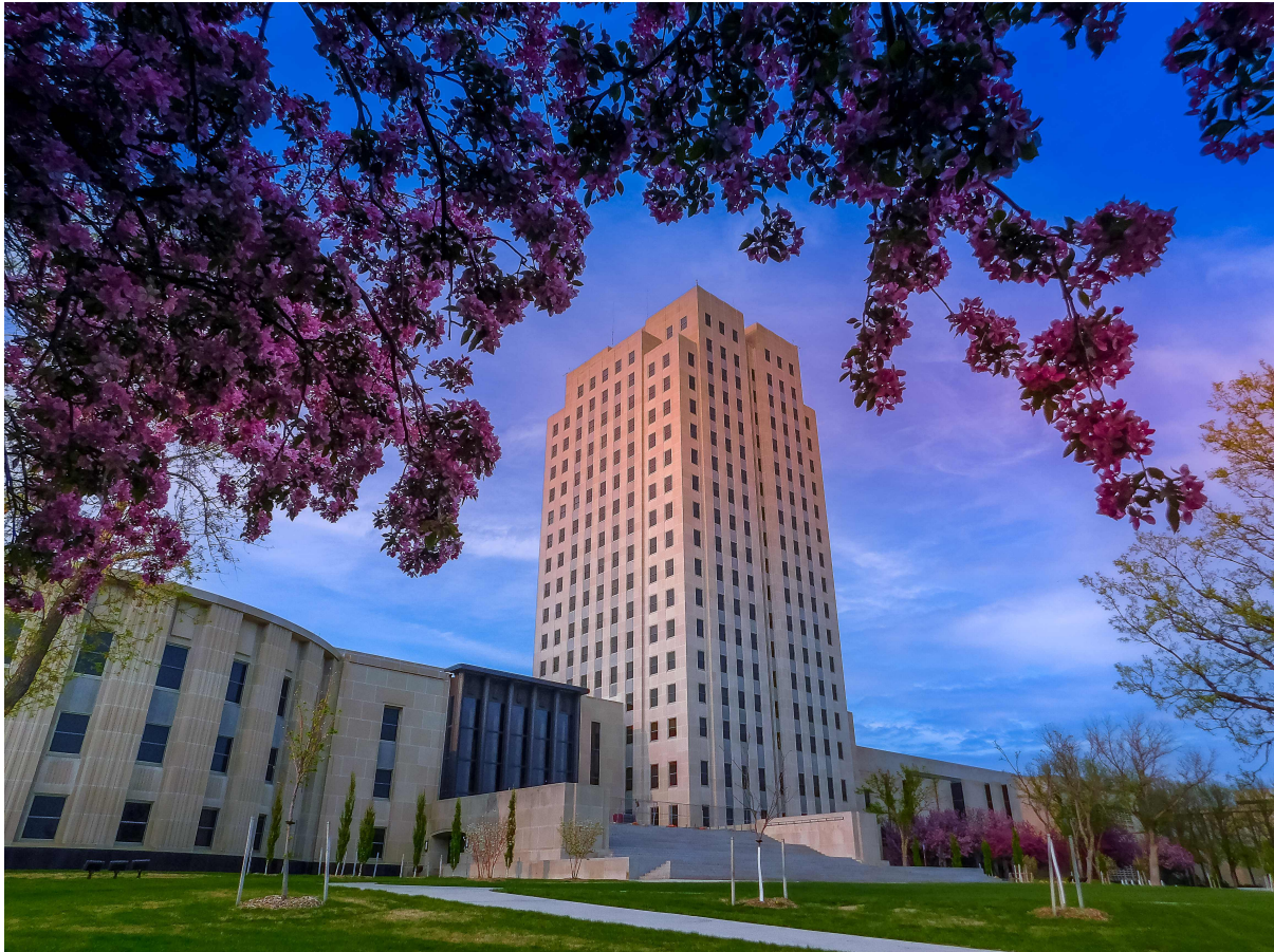
Photo by Paulette Bullinger of the North Dakota Capitol Building and tree blossoms.

The Dakota Conference Communication Department is always looking for beautiful photos to use in the Dakota Dispatch , Dakota Messenger , the website, and more. If you are willing to share, please send them to j.dossenko@gmail.com with the name of the photographer and a short description of where it was taken.