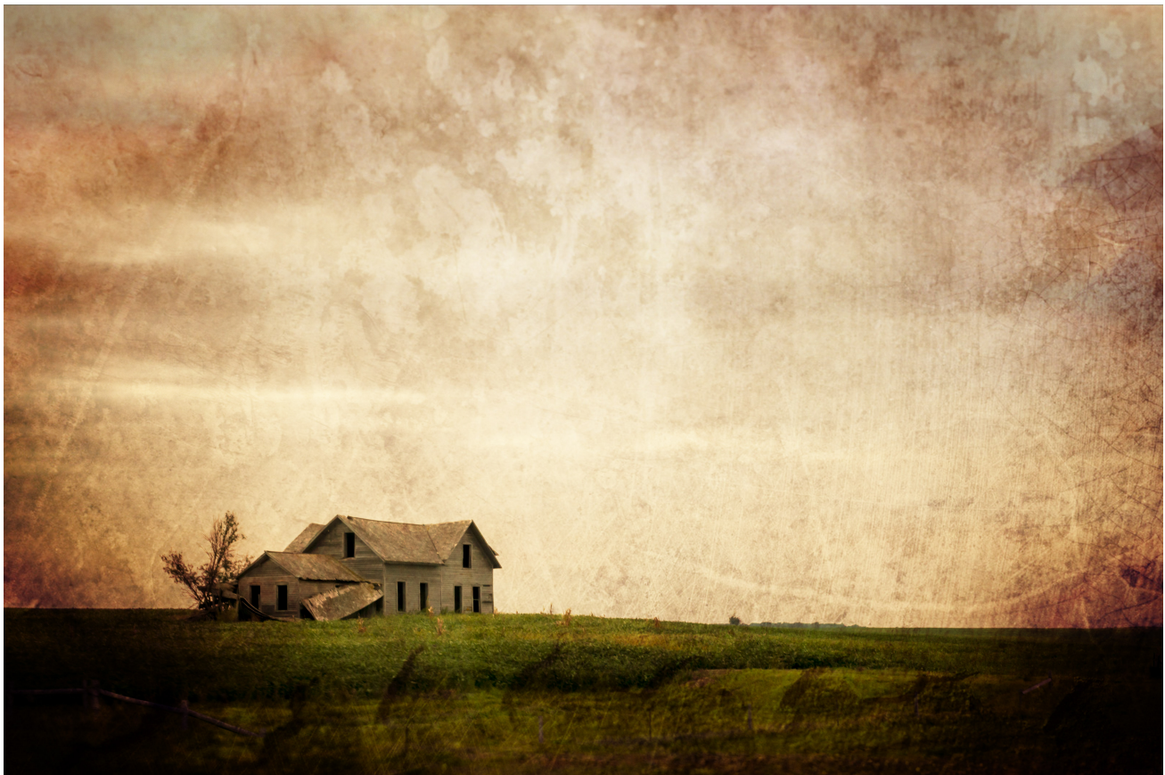
Photo taken in South Dakota by Reese Saxon, DAA registrar and photography teacher.

The Dakota Conference Communication Department is always looking for beautiful photos to use in the Dakota Dispatch , the Dakota Messenger , the website, and more. If you are